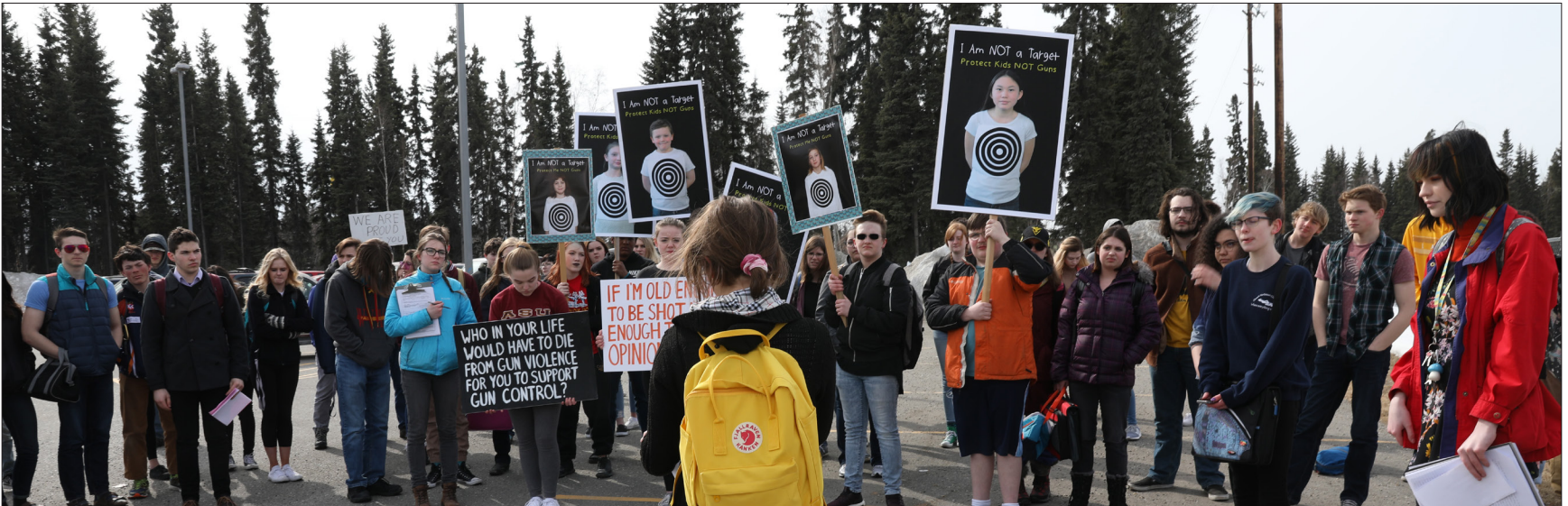
West Valley and Hutchinson High School walkout, Fairbanks, AK - Spring 2018