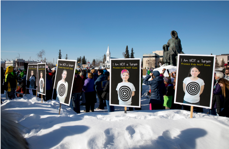
March for Our Lives, Fairbanks, Alaska - March 2018