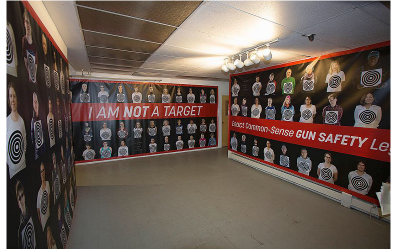
For Freedoms partnership, 50 State Initiative billboard exhibition & town hall on gun safety Fairbanks, AK Fall 2018 (billboards are illegal in AK)*